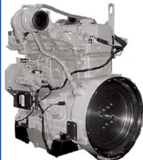
JOHN DEERE 4045HF475 - 4 CYLINDER 4.5L DIESEL ENGINE (TIER 2 EMISSION CERTIFIED)