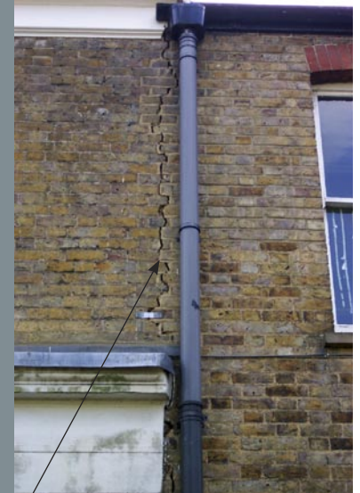
RESULT OF WATER JETTING

Despite the extremely challenging ground conditions the combination of pre-augering and developing additional reaction proved successful. The contract was completed without any further damage to the listed building or boundary walls and the piles were driven to the required level. This contract showed that a two-cylinder Push-Pull mounted on a small LRB125 rig is a very cost effective and efficient tool for carrying out work in difficult ground and logistical conditions.