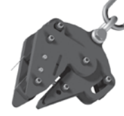
PILE EXTRACTION CLAMPS