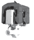
EXCAVATOR MOUNTED VIBRATORS