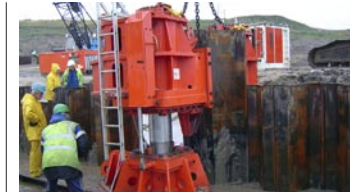
Specialist Work >