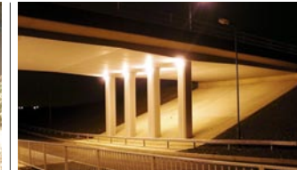
Sustainable Foundation >