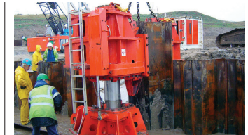
Specialist Work >