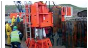
Specialist Work >